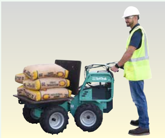
Shown with TuffTruk Flatbed accessory.